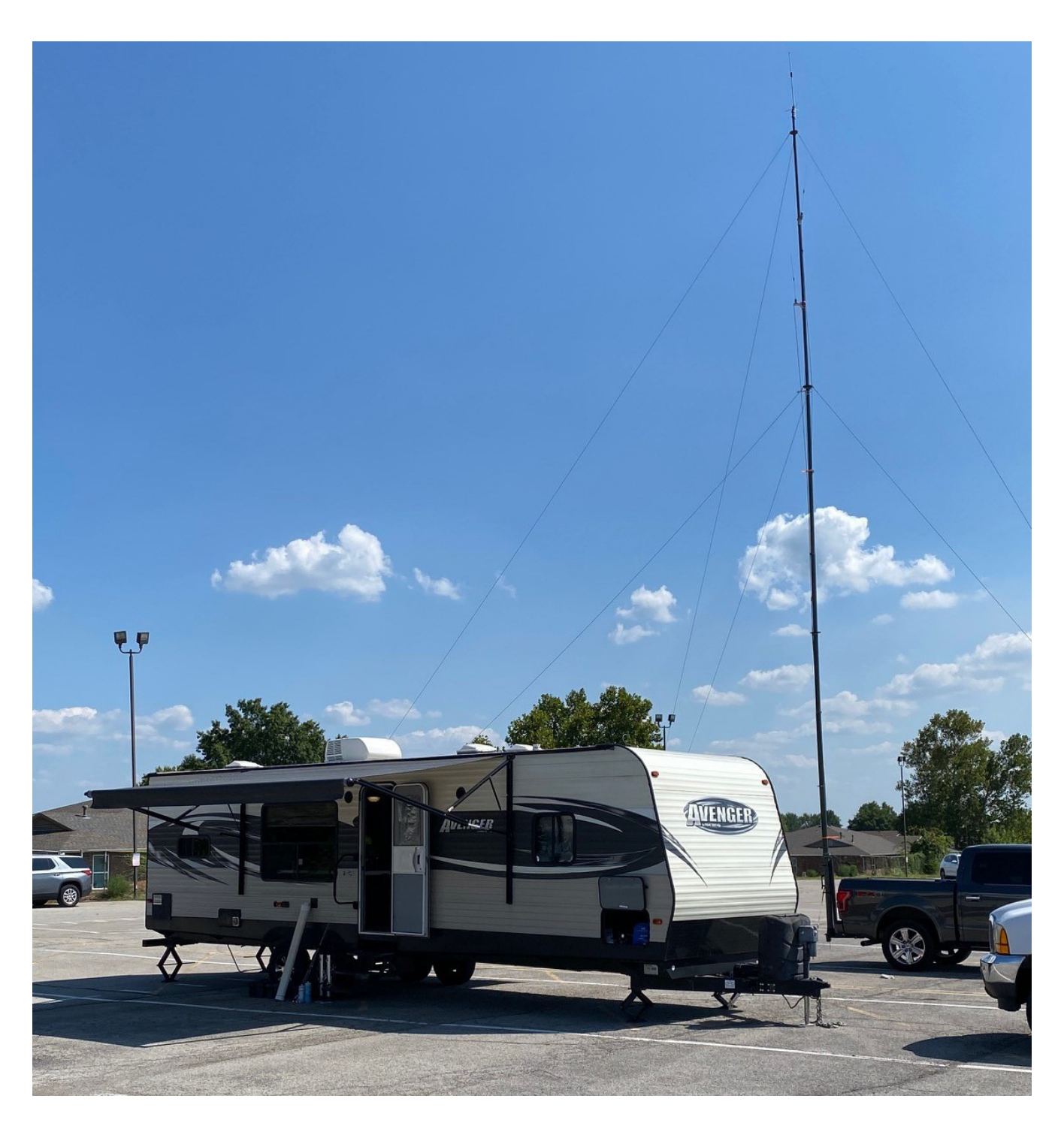
Command post trailer with ~45 ft mast