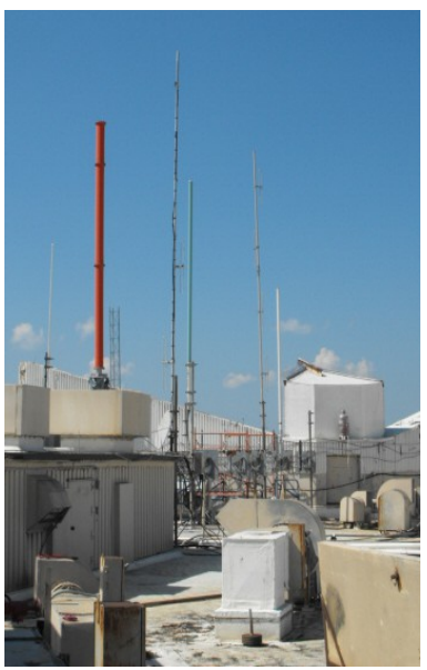
View from Northeast