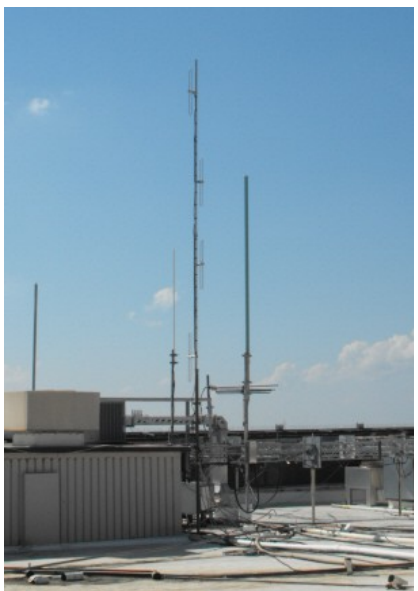
View from the North