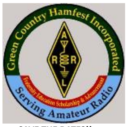
SAVE THE DATES!!

Schedule for 2017: 14 JAN 11 FEB 11 MAR 08 APR 13 MAY 10 JUN 08 JUL 12 AUG 09 SEP 14 OCT 11 NOV 09 DEC