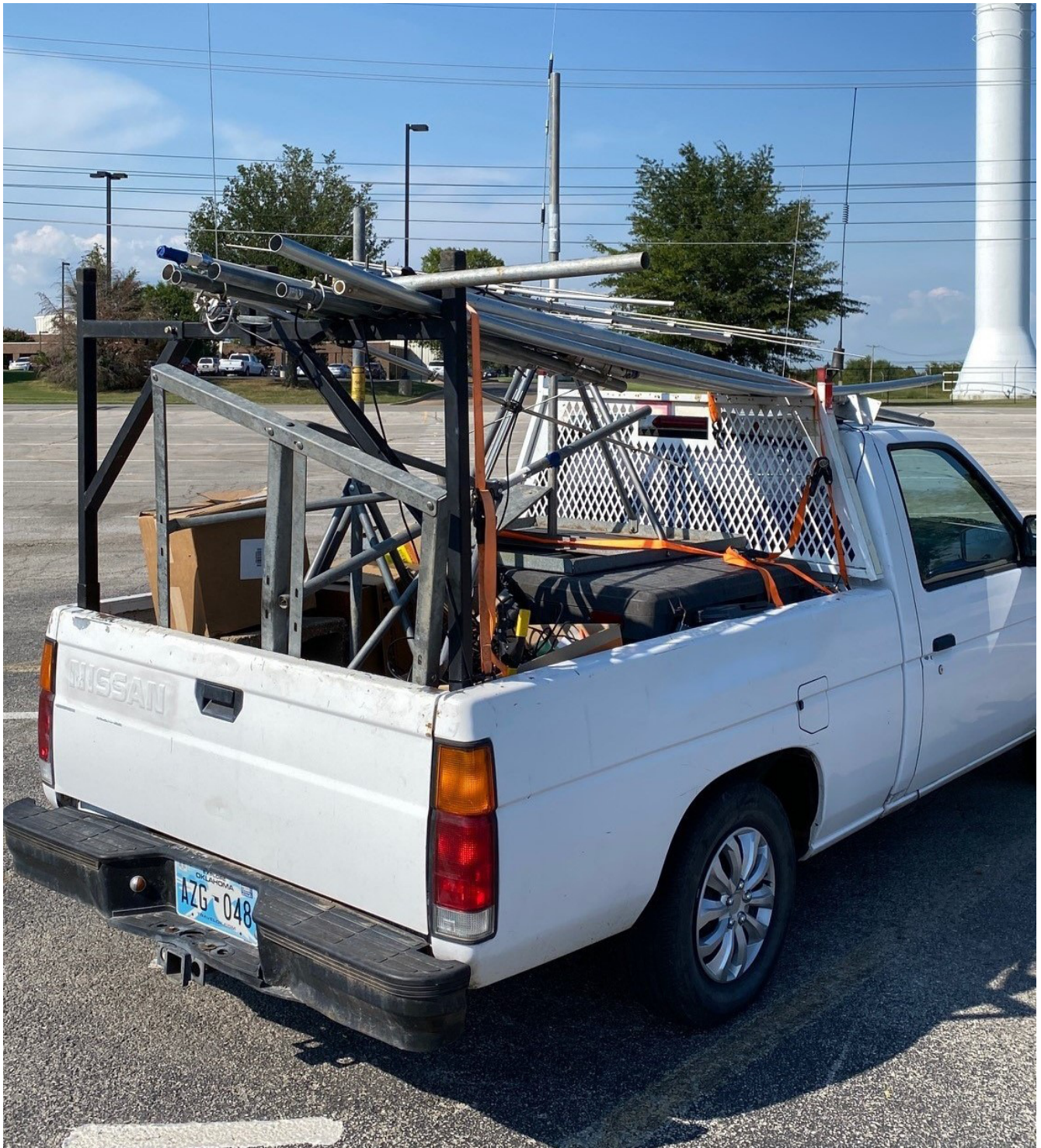
APRS Equipment Truck