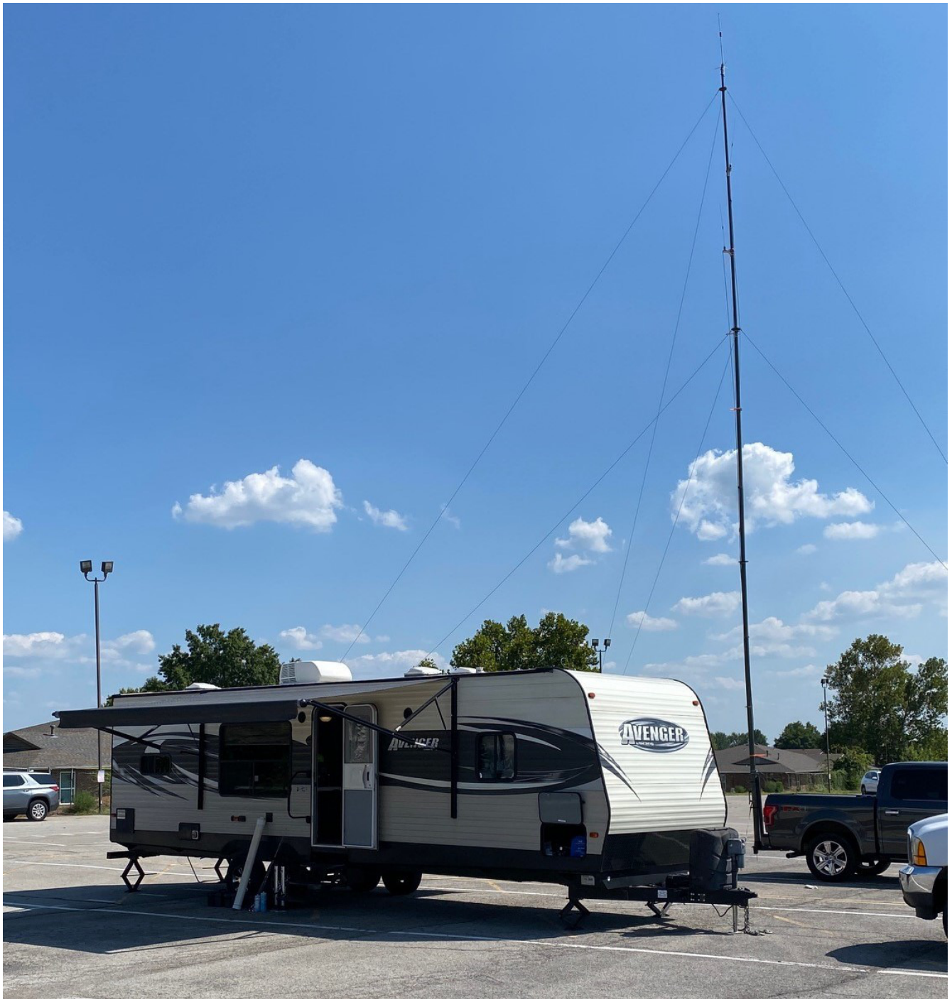
Command post trailer with ~45 ft mast