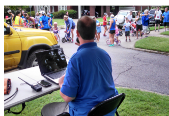
Trike Race Line Up