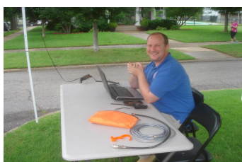
Net Control KG5CBM