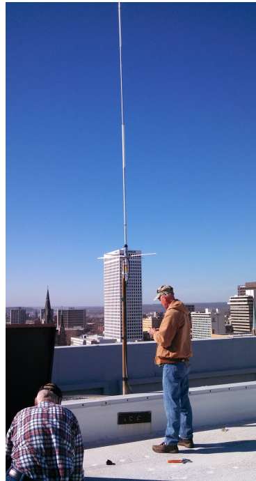
Left—Tom Shaw— K5OVT Right—Joe Gorkos— N5TEX Completing the install of the Hustler G7 antenna for the 146.94 repeater atop the Sun Building 9th & Detroit downtown Tulsa.

Below are front and rear view pictures of the 444.1 repeater installed at the Skyline East Building.