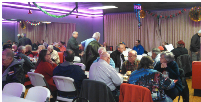
A look at the crowd before the TRO/TARC Christmas Party, Tuesday, 16 DEC 14 at Tally's Good Food Cafe, 11 th & Yale.

Turnout was good, food was good, prizes were good, the fun was good.... everything was good!