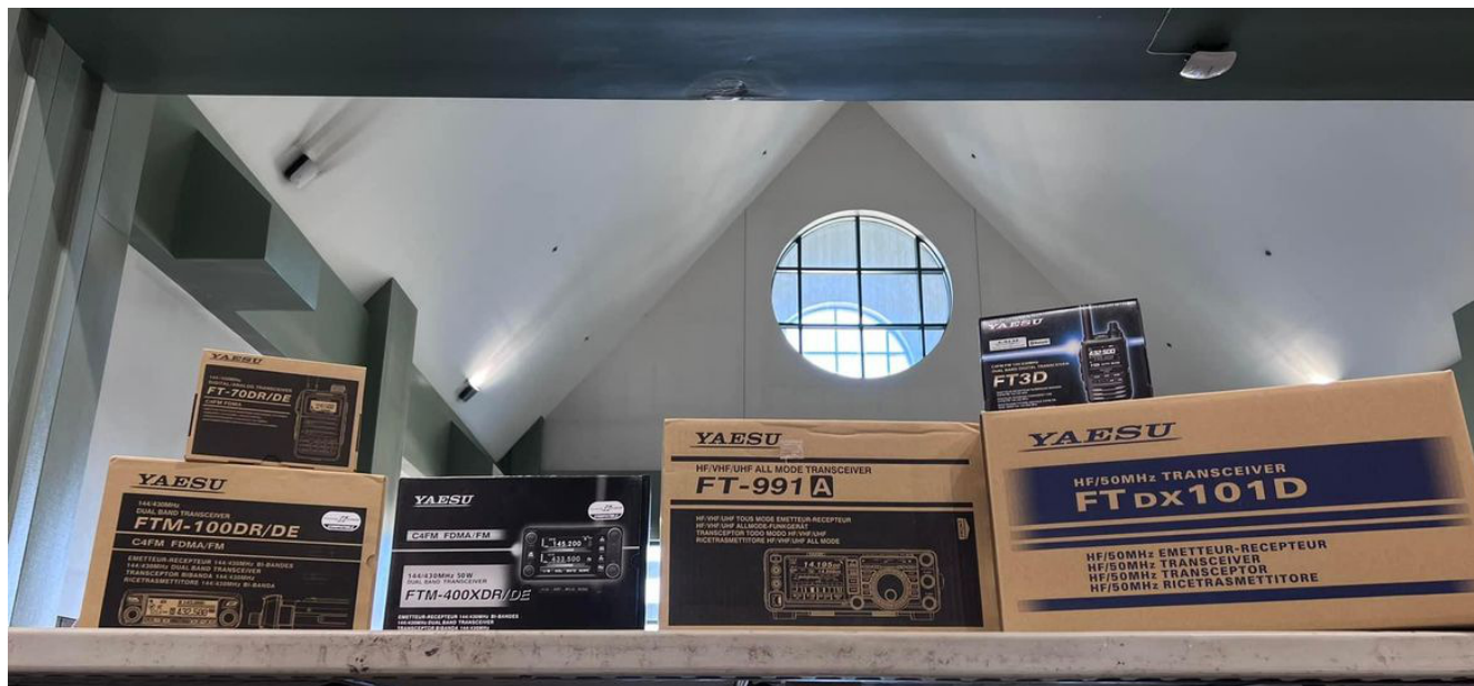
Main prizes given away at the 2022 hamfest.